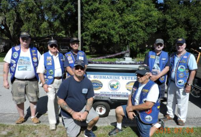
Parade Kenneth City July 4th 2015