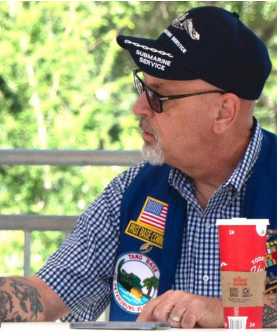
Tolling of the Boats