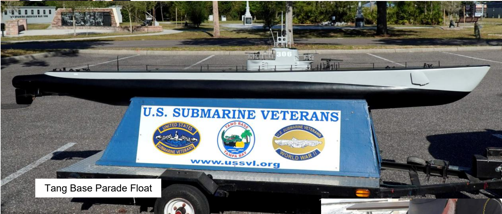
Tang Base Parade Float