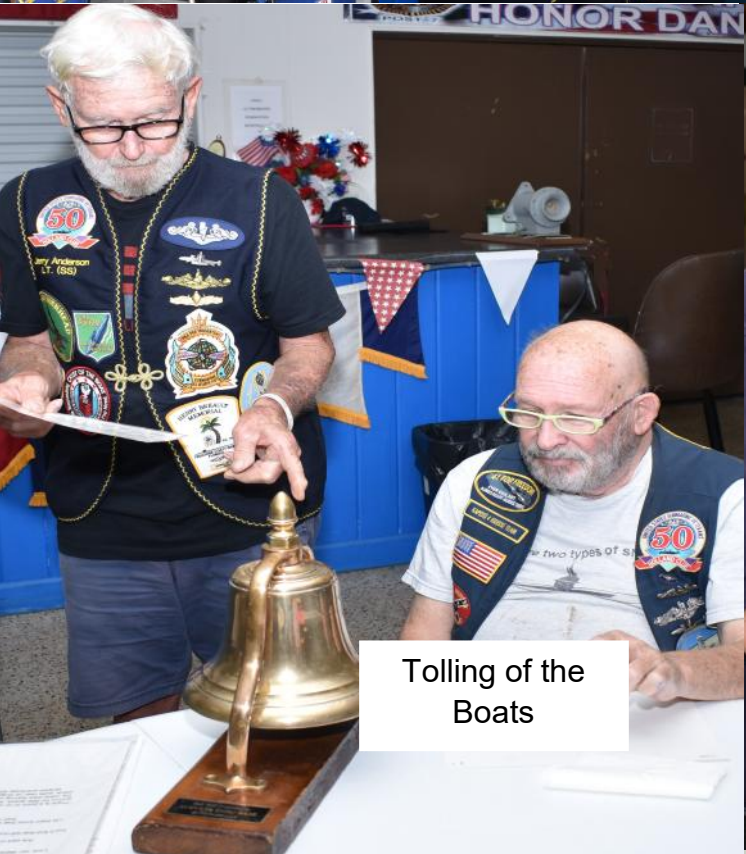
Tolling of the Boats