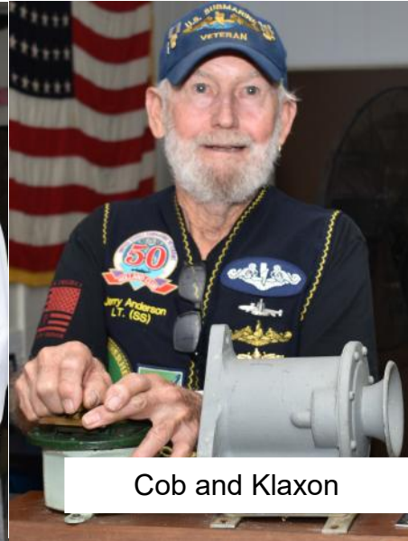
Cob and Klaxon