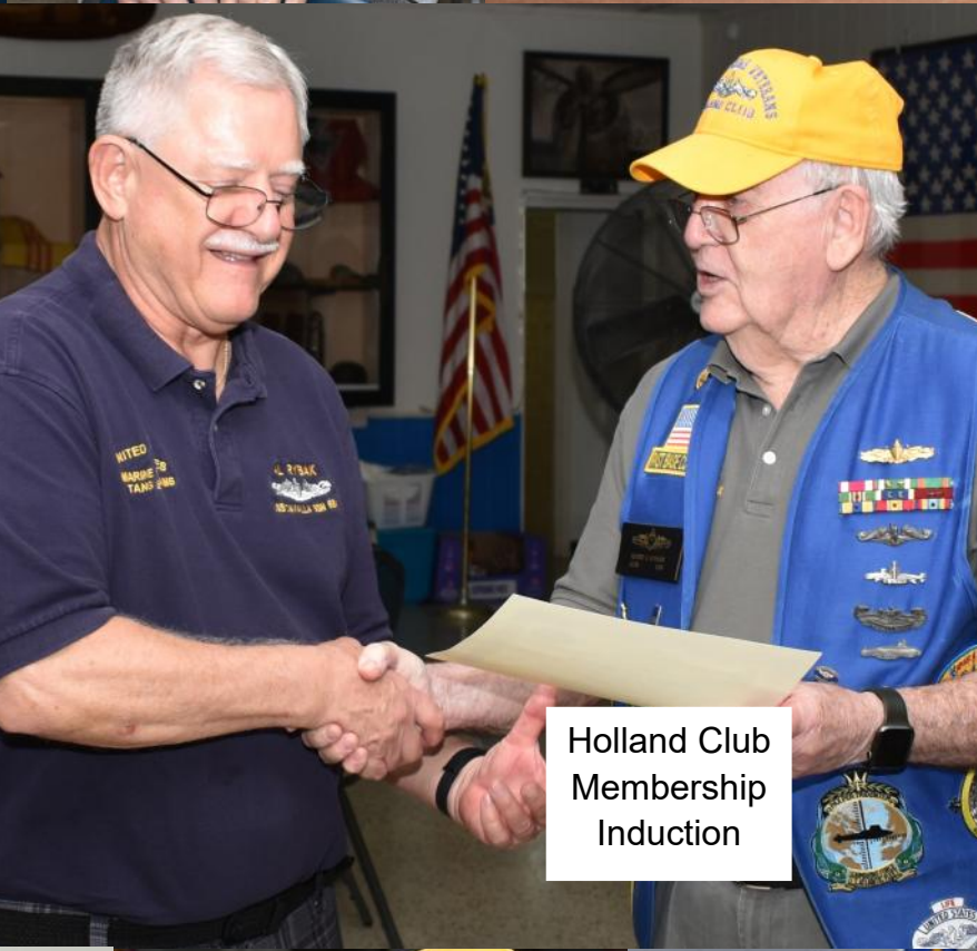
Holland Club Membership Induction