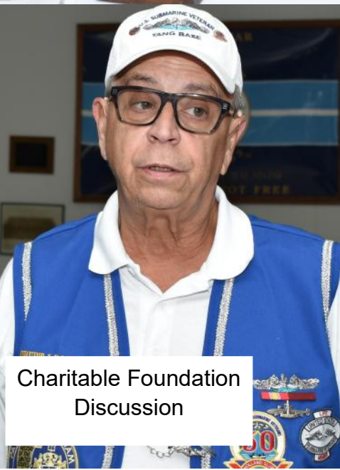
Charitable Foundation Discussion