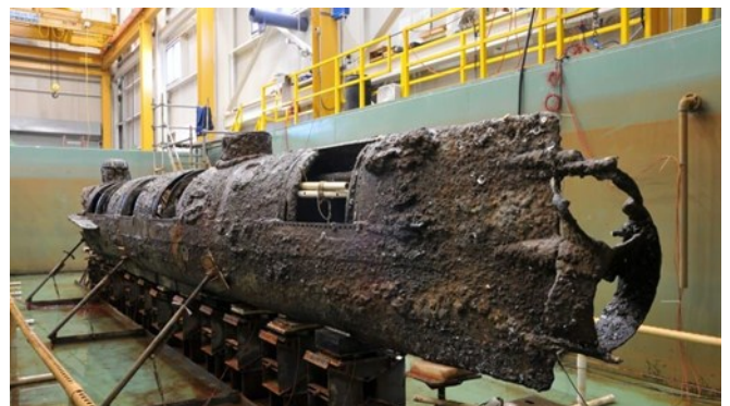
The Remains of the H. L. Hunley.