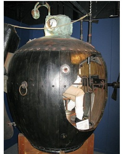
Turtle Model at Royal Navy Museum.

It wasn't until the Civil War that a submarine was successfully used in combat. That was the Confederate submarine, H. L. Hunley. It sank on one of its first training missions in August 1863. Five crewmembers died. It was raised, returned to service, and sank again two months later. Eight crew including the boat's inventor, Horace Hunley, died this time. She was recovered again and returned to service. In February 1864, she was outfitted with a torpedo attached to a long pole which she rammed into a Union ship, the USS Housatonic. The blast killed five of the Housatonic's 155 crewmen and caused the Housatonic to sink in about five minutes. The Hunley was also damaged and sunk yet again, killing all eight of her crew. The Hunley and her crew remained on eternal patrol for 136 years until they were recovered in 2000. The remains of the eight crewmen were laid to rest in 2004.