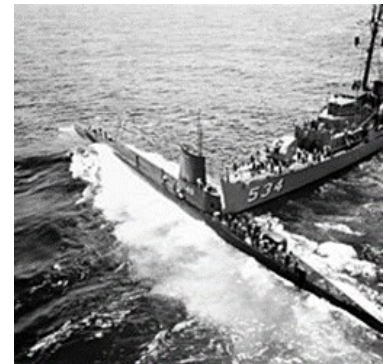
Stickleback Rammed by Silverstein